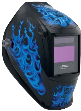
Blue Rage™ 282001