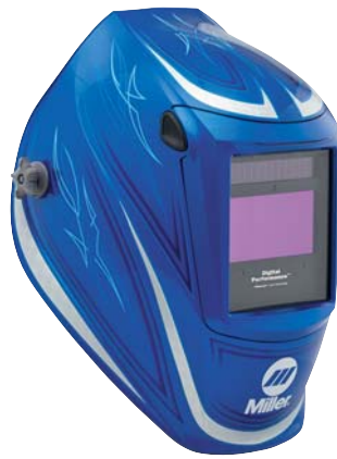
'64 Custom™ 282002